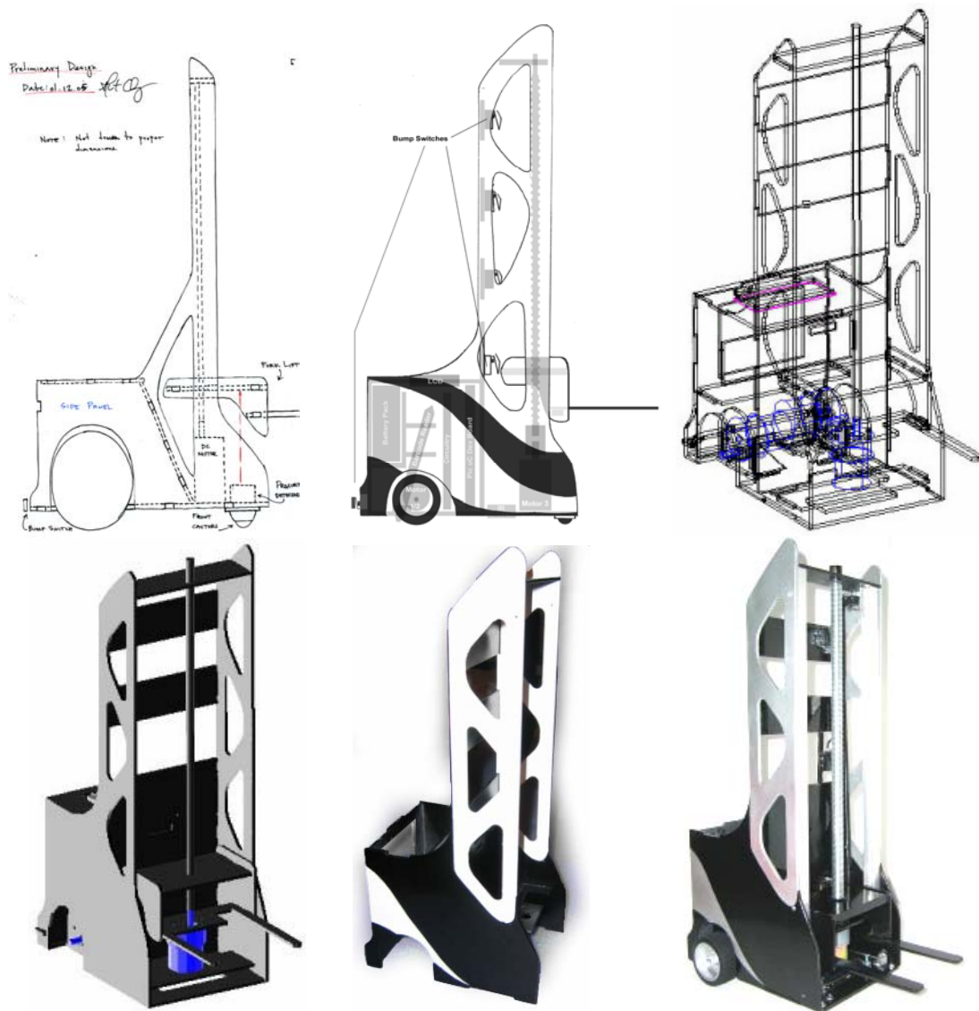
Figure 2 Mobile Platform

The circuitry and motors are encased in a durable platform constructed of thin craft plywood. The platform was designed to address a top heavy mass when fully loaded with a pallet. To counter the weight I placed the two motors in the rear, two casters in the front, and the batteries and electronics in the rear compartment. I began with rough sketches the design that I wanted and then drafted a similar design in AutoCAD to be used for the T-Tech.