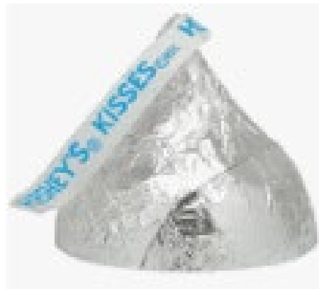
Figure 4: Ideal solder joint.

A good solder should have the shape of a Hershey's Kiss (without the wrinkles). By the way, the first Hershey's Kiss was manufactured in 1907!